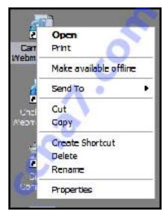
ITE Pretest Exam Answer v6 001