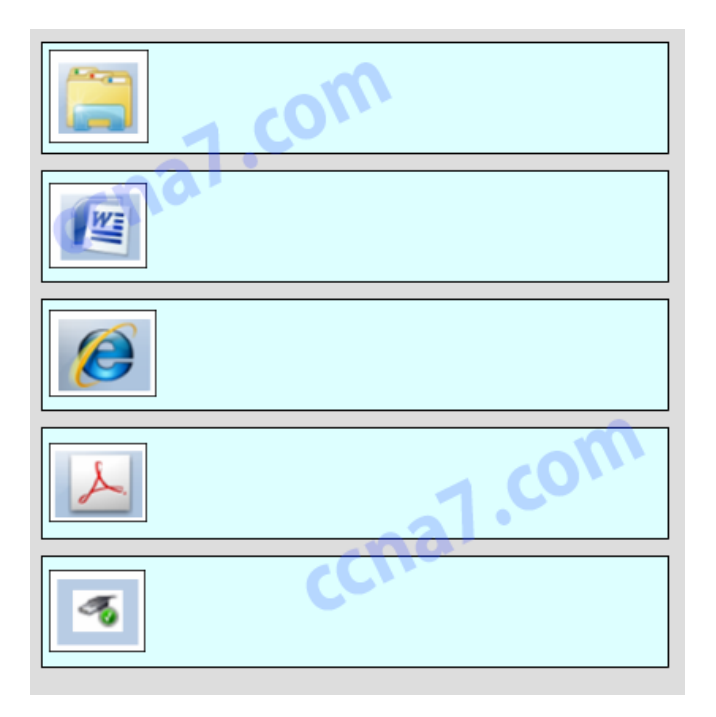
ITE Pretest Exam v6 Answer 001